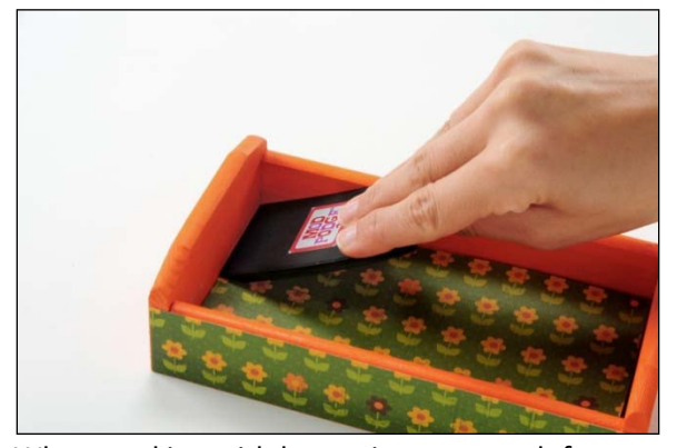
When working with large pieces, smooth from the center outward. Air bubbles can be removed with the Mod Podge Tool Set. Use the squeegee with smaller items such as trays – it was developed specifically for getting into corners.