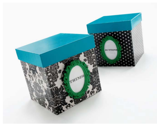
Bright color combinations look great, especially with black and white. Use small dollar store frames to label the front of your storage.