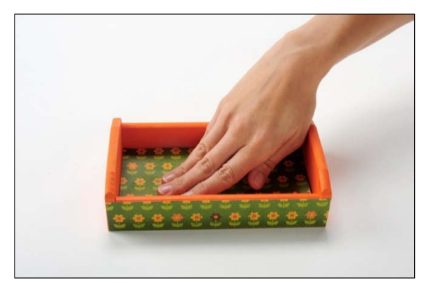
Keep smoothing until all of the bubbles are removed.