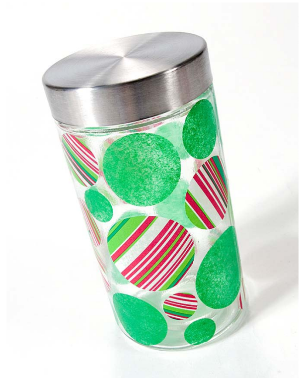
I definitely like Christmas, but sometimes I like it subtle. This holiday container celebrates the colors of the season – and if you like a little more bling, you can dress it up with added embellishments.