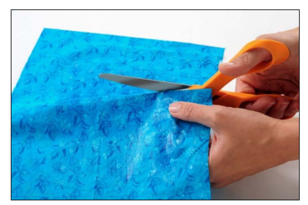
Allow to dry. This will allow you to cut the fabric like paper without frayed edges.

Fabric – Wash and dry the fabric (do not use fabric softener). Iron and then lay out on a covered work surface. Wax paper is preferable for covering your table. Using a brush, paint a light coat of Fabric Mod Podge onto your fabric.