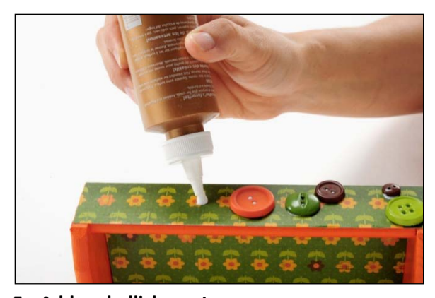
5. Add embellishments Once your project is dry, add embellishments as desired. Adhere them with a suitable adhesive